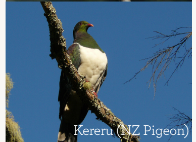
Kereru (NZ Pigeon)

This loop walk is generally an easy gradient on a grass track, with outstanding views of the Hauraki Gulf, beaches and regenerating bush. The track includes access to Ocean Beach, Snapper Bay, Calypso Bay and views over Ohinerau Bay. There are some marked Link tracks off this track which provide quicker routes to other destinations. Depending on wind direction it is always possible to find a sheltered beach for a picnic.