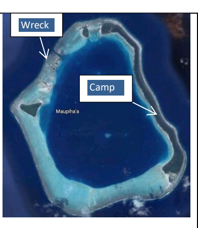
Maupelia where Seeadler was wrecked