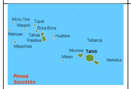
French Polynesia showing Maupelia (French spelling = Maupihaa)