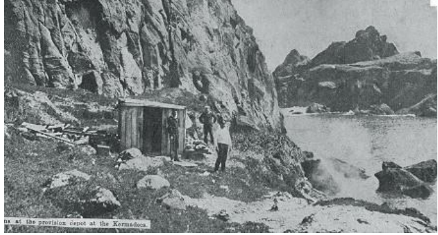
The Govt emergency store at the Kermadecs.