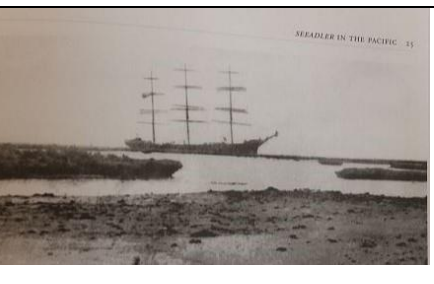
Seeadler at anchor off the reef at Maupelia.