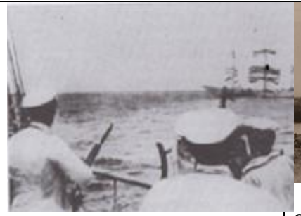
The Seeadler crew sinking a ship in the Atlantic.