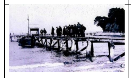
The jetty on Wharf Bay beach where the excapees left from.