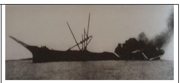
Seeadler on fire after the attempt to blow her masts up to conceal the ship.