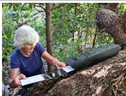
Disaster Gully 2022