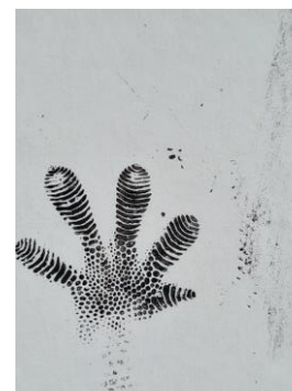
C photo Chris Challinor